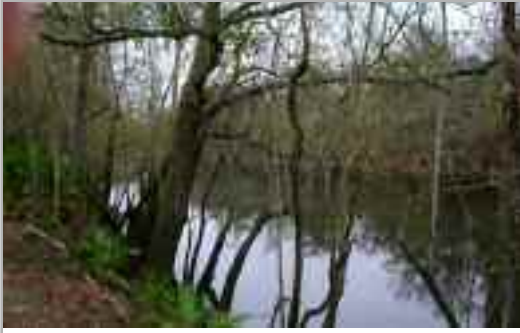
The view of the Little Ocmulgee River from the entrance to the property